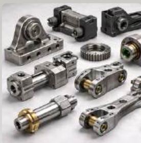
CNC Machined Metal Components

We manufacture precision components and assemblies for railway safety, utility and electrical systems.