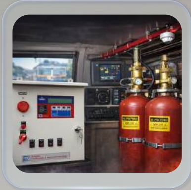
High Pressure Water Mist

Fire detection, suppression and control for rolling stock