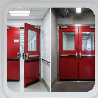
Fire Safety Doors Designed to resist. Built to protect