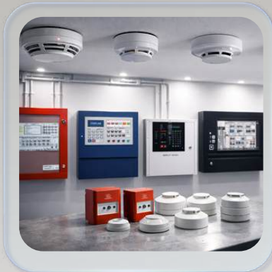
Fire Control Panels Reliable system intelligence