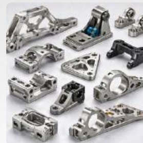
Precision Brackets & Mounts