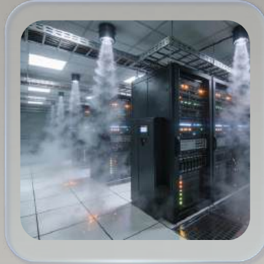
Aerosol Fire Protection System