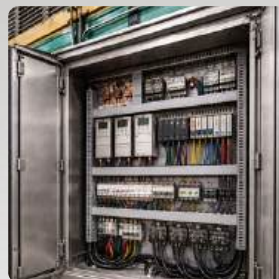
Electrical Panels & Enclosures