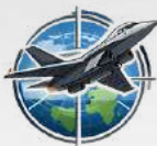
Aerospace & Defence