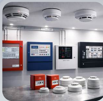
Fire Control Panels Reliable system intelligence