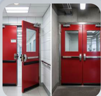
Fire Safety Doors Designed to resist. Built to protect