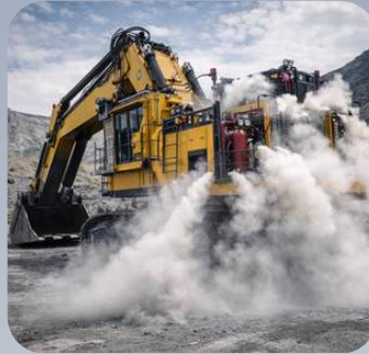
ABC Powder System