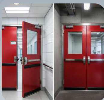
Fire Safety Doors Designed to resist. Built to protect