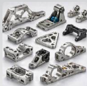
Aerospace-style brackets & mounts