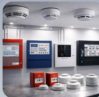
Fire Control Panels Reliable system intelligence