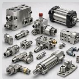
Hydraulic / pneumatic precision parts