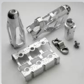
CNC-machined structural parts

Precision-manufactured components and assemblies built with process discipline, repeatability, and reliability demanded by aerospace, defence, and other critical industries.