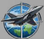
Aerospace & Defence

From fire-critical safety systems to precision-manufactured components, we deliver reliable engineering solutions for high-reliability industries.