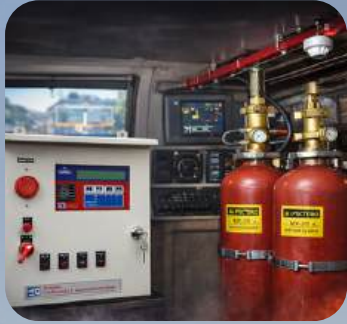
High Pressure Water Mist