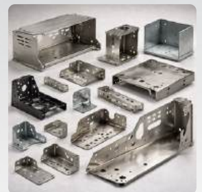
Sheet-metal laser-cut & bent assemblies