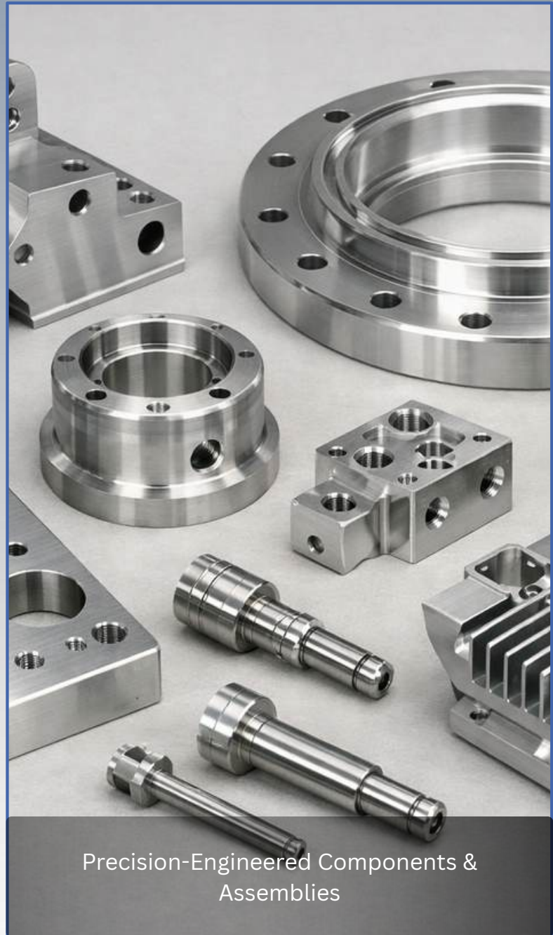
Precision-Engineered Components & Assemblies

From fire-critical safety systems to precision-manufactured components, we deliver reliable engineering solutions for high-reliability industries.