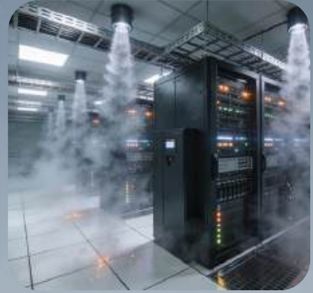
Aerosol Fire Protection System