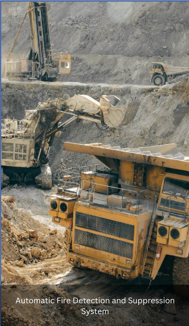
Automatic Fire Detection and Suppression System

Fire Protection Systems & High-Accuracy Engineering for Critical Industries