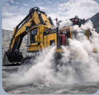
ABC Powder System